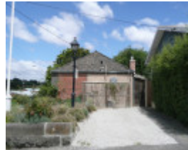
MONTROSE COTTAGE SOHE 2008