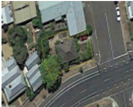
Montrose Cottage aerial diagram