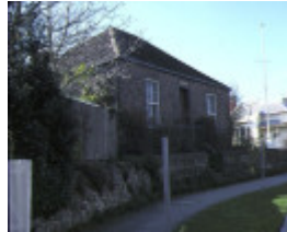
1 montrose cottage ballarat front view