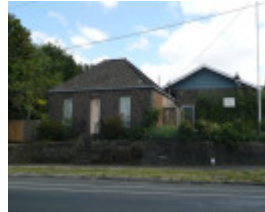
MONTROSE COTTAGE SOHE 2008