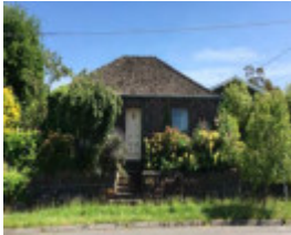
Montrose Cottage 2020