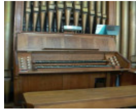
B2571 Svensson Pipe Organ