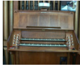
B2571 Svensson Pipe Organ