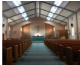
B2571 Svensson Pipe Organ