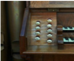
B2571 Svensson Pipe Organ