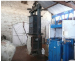
TITANGA HOMESTEAD SOHE 2008