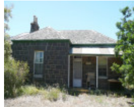
TITANGA HOMESTEAD SOHE 2008