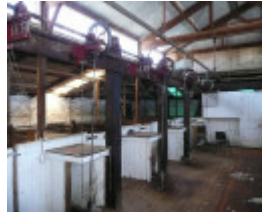
TITANGA HOMESTEAD SOHE 2008