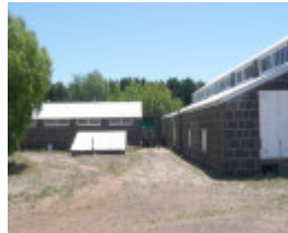
TITANGA HOMESTEAD SOHE 2008