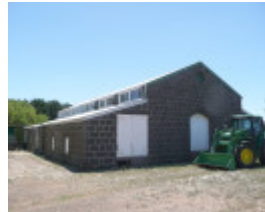
TITANGA HOMESTEAD SOHE 2008