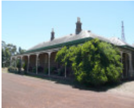
TITANGA HOMESTEAD SOHE 2008