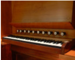
B6112 St John's Anglican Church Pipe Organ