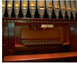
B6112 St John's Anglican Church Pipe Organ