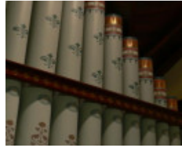
B6112 St John's Anglican Church Pipe Organ