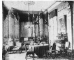
B0005 Elsternwick Rippon Lea 1880s