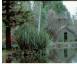
B0005 Ripponlea Gardens & pond