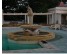
B0005 Ripponlea Fountain