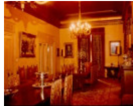
B0005 Ripponlea Dining Room