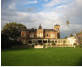
B0005 Ripponlea House & Fountain