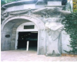
B6479 Underground Carpark