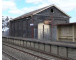
LITTLE RIVER RAILWAY STATION AND GOODS YARD SOHE 2008