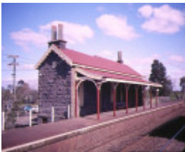
little river railway station & goods yard school road little river trackside view aug1997