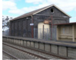
LITTLE RIVER RAILWAY STATION AND GOODS YARD SOHE 2008