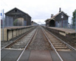
LITTLE RIVER RAILWAY STATION AND GOODS YARD SOHE 2008