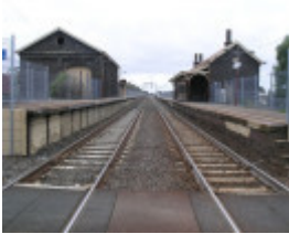
LITTLE RIVER RAILWAY STATION AND GOODS YARD SOHE 2008