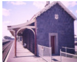
little river station & goods yard school road little river platform side view aug1997