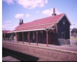
1 little river railway station & goods yard school-road little river platform view aug1997