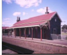
1 little river railway station & goods yard school-road little river platform view aug1997