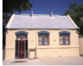
1 primary school no 744 lockwood front view dec1997