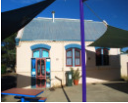
PRIMARY SCHOOL NO.744 SOHE 2008