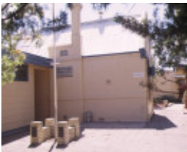
primary school no 744 lockwood side view dec1997