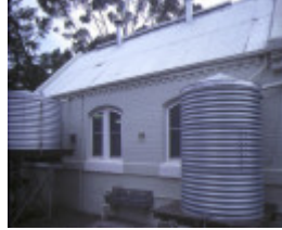
primary school no 744 lockwood rear view of school jul1984