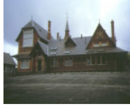
former primary school number 2120 long gully rear view