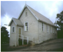
former primary school number 2120 long gully timber classroom