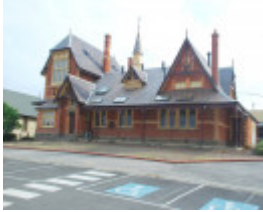
PRIMARY SCHOOL NO. 2120 SOHE 2008