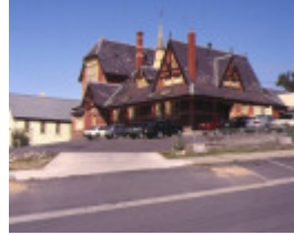
1 former primary school number 2120 long gully front view