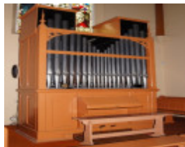
B6011 St Monica's Organ