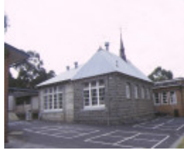
1 primary school no 2162 grove road lorne yard view mar1998