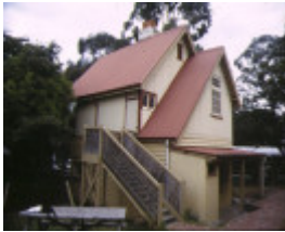
primary school no 2162 grove road lorne residence mar1998