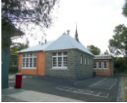
PRIMARY SCHOOL NO.2162 SOHE 2008