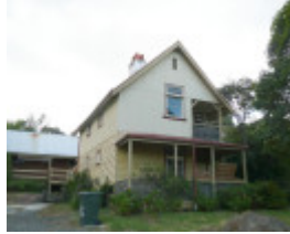
PRIMARY SCHOOL NO.2162 SOHE 2008