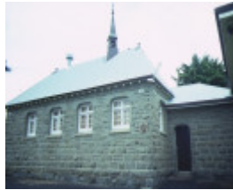
primary school no 2162 grove road lorne side elevation jul1984