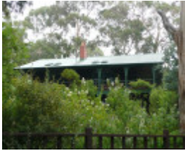
LEIGHWOOD SOHE 2008