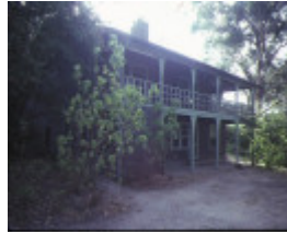
1 leighwood mountjoy parade lorne front view mar1985