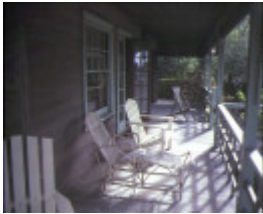
leighwood mountjoy parade lorne verandah mar1985