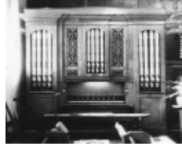
B5966 St Kilda East Congregational Pipe Organ