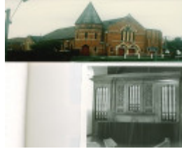
B5966 Uniting Church & Organ