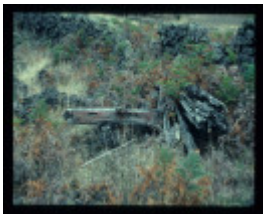
LAKE CONDAH - COMPLEX G FEATURE