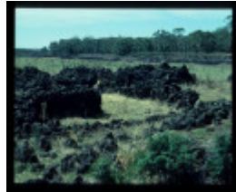
LAKE CONDAH - COMPLEX G