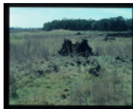
LAKE CONDAH - COMPLEX G FEATURE