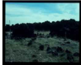
LAKE CONDAH - COMPLEX G