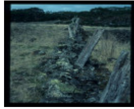
LAKE CONDAH - COMPLEX G FEATURE