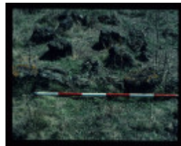
LAKE CONDAH - COMPLEX G FEATURE