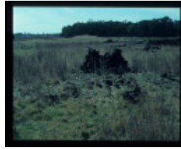
LAKE CONDAH - COMPLEX G FEATURE