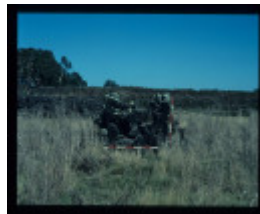
LAKE CONDAH - COMPLEX G FEATURE