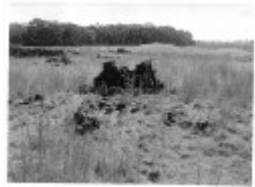
Chimney butt and footings for timber building (H7221-0229), facing south-west