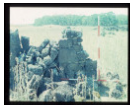
LAKE CONDAH - COMPLEX G FEATURE