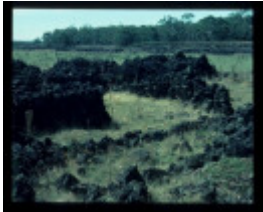
LAKE CONDAH - COMPLEX G