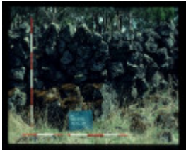
LAKE CONDAH - COMPLEX G FEATURE