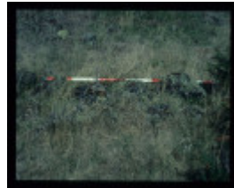
LAKE CONDAH - COMPLEX G FEATURE