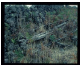
LAKE CONDAH - COMPLEX G FEATURE