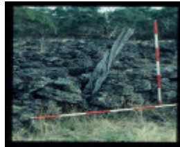
LAKE CONDAH - COMPLEX G FEATURE