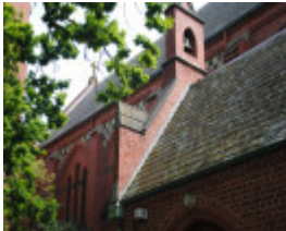
B5709 St Albans Church side exterior