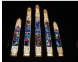
B5709 St Albans Church front window