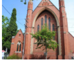
B5709 St Albans Church front