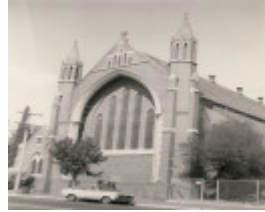
B5709 St Alban's Anglican Church