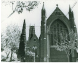
B5709 St Alban's Anglican Church