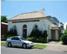
NATIONAL AUSTRALIA BANK SOHE 2008