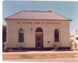
h00399 1 national bank maffra 1977