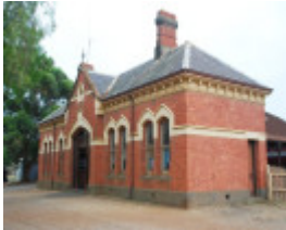
MALDON RAILWAY STATION COMPLEX SOHE 2008