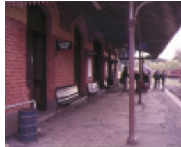
maldon railway station complex hornsby street maldon platform view