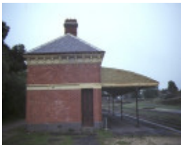
maldon railway station complex hornsby street maldon side view