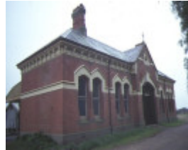
1 maldon railway station complex hornsby street maldon front view