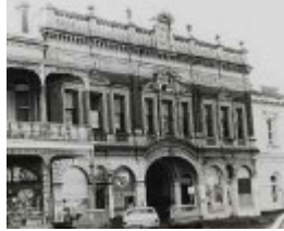
B3565 Fmr Mining Exchange