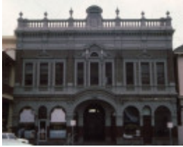
B3565 Fmr Mining Exchange