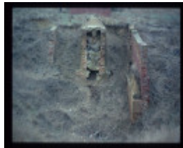
NEW LANGI LOGAN NO.1