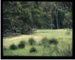
MAFEKING ALLUVIAL WORKINGS