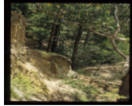
MAFEKING ALLUVIAL WORKINGS