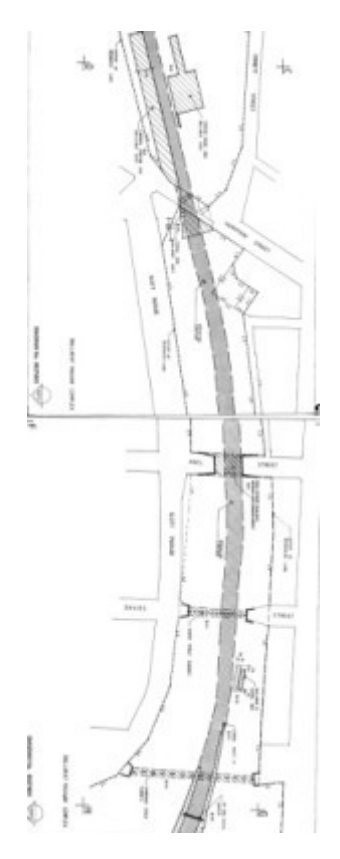
ballarat railway station registration plans3and4