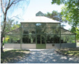
CENTRAL PARK CONSERVATORY SOHE 2008