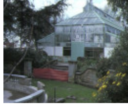
central park conservatory wattletree road malvern rear view