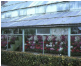
central park conservatory wattletree road malvern side view