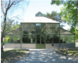
CENTRAL PARK CONSERVATORY SOHE 2008