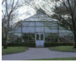
1 central park conservatory wattletree road malvern front view