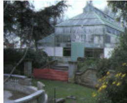
central park conservatory wattletree road malvern rear view