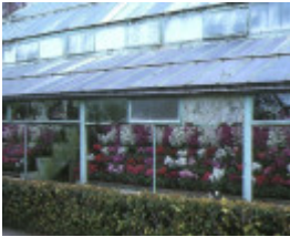
central park conservatory wattletree road malvern side view