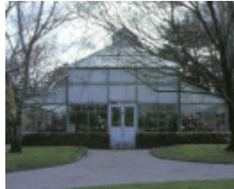
1 central park conservatory wattletree road malvern front view