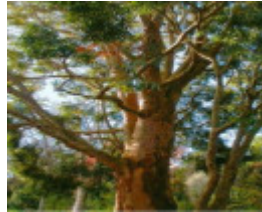
T12193 Angophora costata