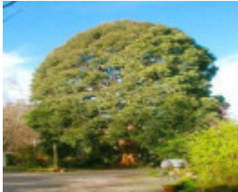
T12193 Angophora costata