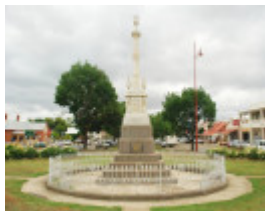
POLICE MEMORIAL SOHE 2008