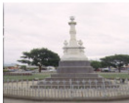
police memorial mansfield front view jan1999