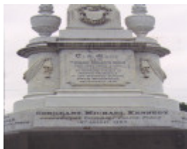
police memorial mansfield inscription detail jan1999