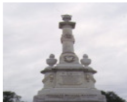
1 police memorial mansfield sculpture detail jan1999