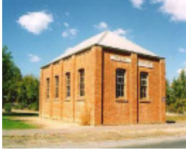
B2420 Federal Standard