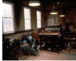
B2420 Federal Standard