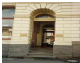
1 former es& a bank lydiard street north ballarat exterior entrance