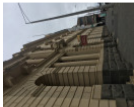
Former ANZ Bank 3