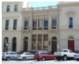
FORMER ANZ BANK SOHE 2008