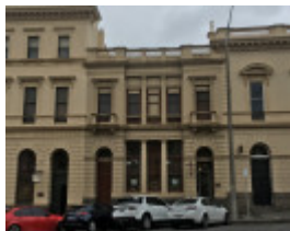
Former ANZ Bank