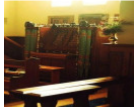
B6219 St John's Pipe Organ