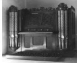
B6219 St John's Pipe Organ