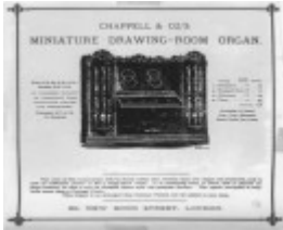
B6219 St John's Pipe Organ