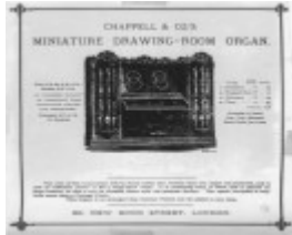
B6219 St John's Pipe Organ