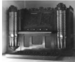
B6219 St John's Pipe Organ