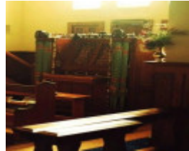
B6219 St John's Pipe Organ