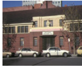
1 former royal australian army medical corps training depot a'beckett street melb front entrance 1990