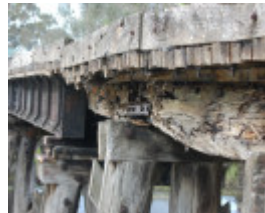
B6912 Rail Bridge