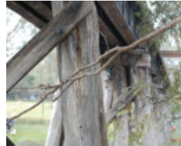
B6912 Rail Bridge