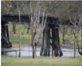
B6912 Rail Bridge