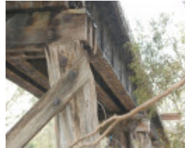
B6912 Rail Bridge Girders