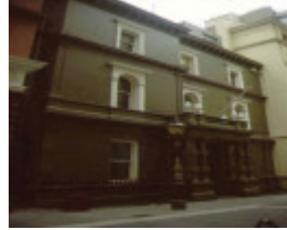
1 savage club exterior sw apr1999