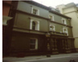
1 savage club exterior sw apr1999