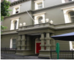
MELBOURNE SAVAGE CLUB SOHE 2008