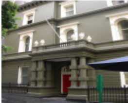
MELBOURNE SAVAGE CLUB SOHE 2008