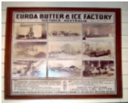
B6274 Euroa Butter Factory