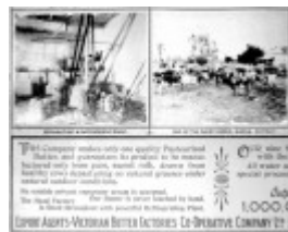
B6275 Euroa Butter Factory