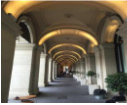
GENERAL POST OFFICE July 2016