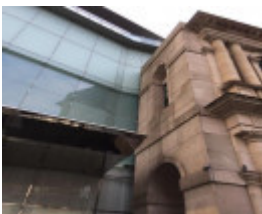
GENERAL POST OFFICE July 2016