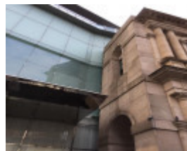
GENERAL POST OFFICE July 2016