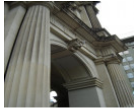
h00903 gpo elizabeth st2