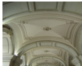
h00903 gpo arcade2