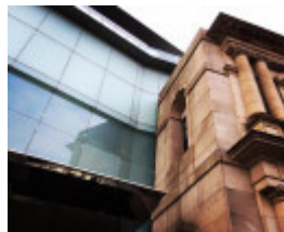
GENERAL POST OFFICE July 2016