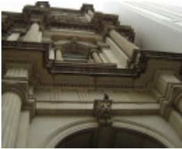
h00903 gpo bourke street