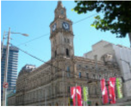
GENERAL POST OFFICE SOHE 2008