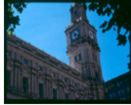
h00903 general post office