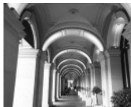
GENERAL POST OFFICE July 2016