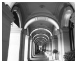
GENERAL POST OFFICE July 2016