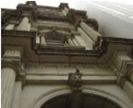
h00903 gpo bourke street