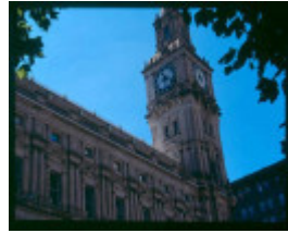
h00903 general post office