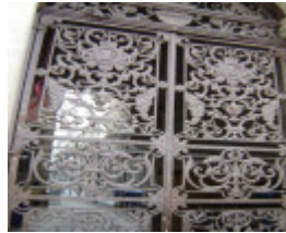
h00903 bourke street gates