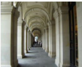
h00903 gpo arcade