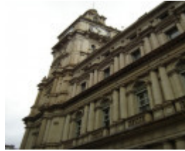
h00903 gpo bourke street2