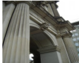
h00903 gpo elizabeth st2