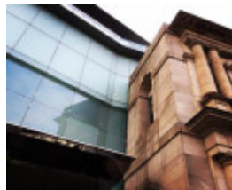
GENERAL POST OFFICE July 2016