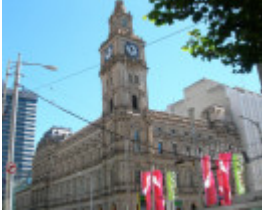
GENERAL POST OFFICE SOHE 2008