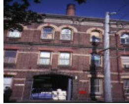
former denton hat mills nicholson street abbotsford delivery entrance