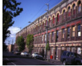
1 former denton hat mills nicholson street abbotsford front view