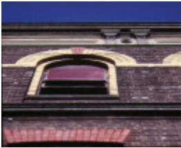
former denton hat mills nicholson street abbotsford detail of window