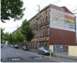
FORMER DENTON HAT MILLS SOHE 2008