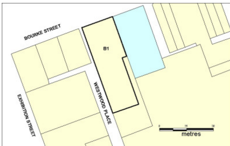
Salvation Army Temple Bourke Street Extent Of Registration Plan March 2000