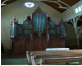
B3508 St Kilian's Catholic Church Pipe Organ