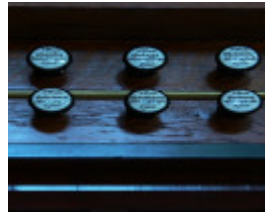
B3508 St Killan's Catholic Church Pipe Organ