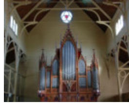
B3508 St Kilian's Catholic Church Pipe Organ