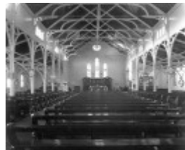
B3508 St Kilian's Catholic Church Interior