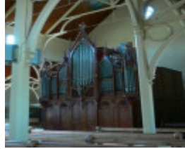
B3508 St Kilian's Catholic Church Pipe Organ