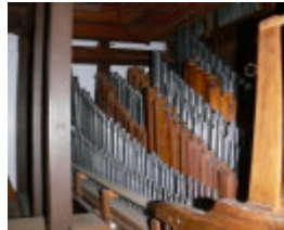
B3508 St Kilian's Catholic Church Pipe Organ