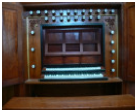
B3508 St Kilian's Catholic Church Pipe Organ