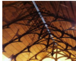
B2520 St.Paul's Anglican Church