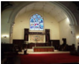
B2520 St.Pauls Anglican Church