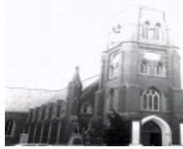
B2520 St Paul's Cathedral