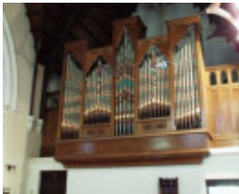
B2520 St.Paul's Anglican Church