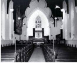
B2520 St Paul's Cathedral Interior