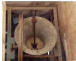
B2520 St.Paul's Anglican Church