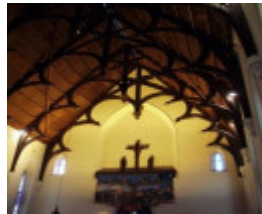
B2520 St.Paul's Anglican Church