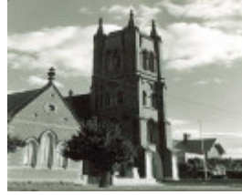
B2520 St Paul's Cathedral