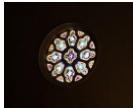
B2520 St.Paul's Anglican Church