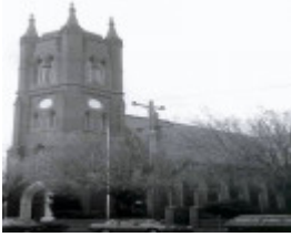
B2520 St Paul's Cathedral