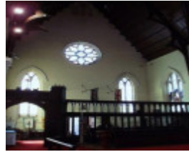
B2520 St.Paul's Anglican Church