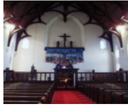
B2520 St.Paul's Anglican Church