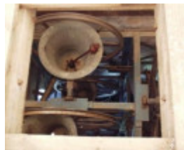
B2520 St.Paul's Anglican Church