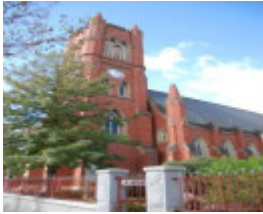
B2520 St Paul's Anglican Cathedral former St Paul's Church