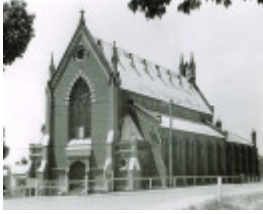
B2404 Uniting Church