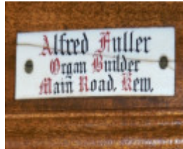
B2404 Uniting Church Pipe Organ