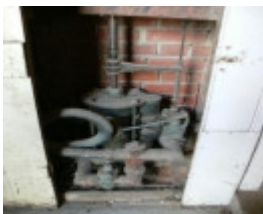
B2404 Uniting Church Pipe Organ