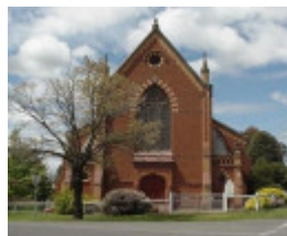
B2404 Uniting Church