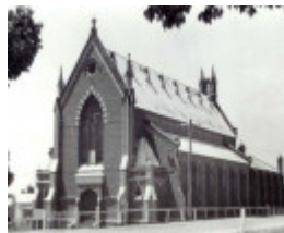
B2404 Fmr Methodist Church