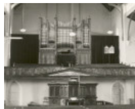
B2404 Uniting Church Fuller Organ