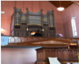
B2404 Uniting Church Pipe Organ