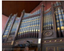
B2404 Uniting Church Pipe Organ