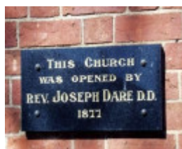
B2404 Uniting Church