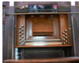
B2404 Uniting Church Pipe Organ