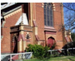
B2404 Uniting Church