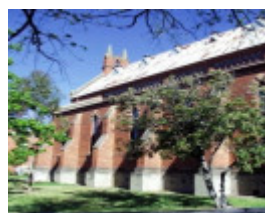
B2404 Uniting Church