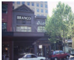
cafe florentino bourke street melbourne street view