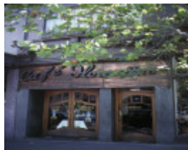
1 cafe florentino bourke street melbourne shop front