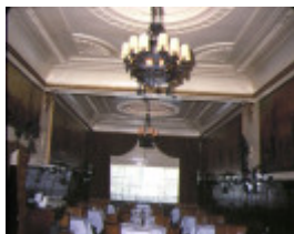
cafe florentino bourke street melbourne interior dining room