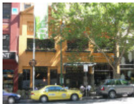
CAFE FLORENTINO SOHE 2008