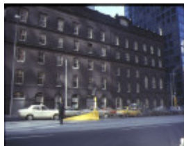
1 goldsbrough mort building bourke rd melb view front