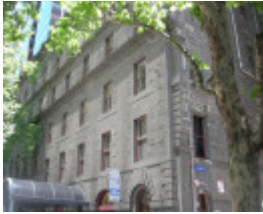
GOLDSBOROUGH MORT BUILDING SOHE 2008