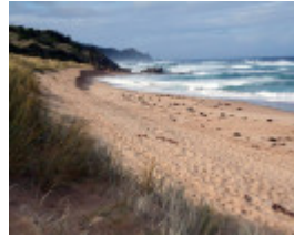
L10177 Great Otway National Park