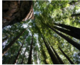
L10177 Great Otway National Park