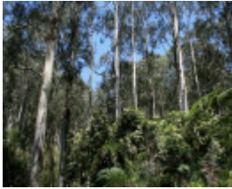
L10177 Great Otway National Park