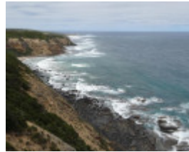
L10177 Great Otway National Park, Cape Otway coast