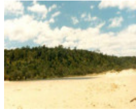
L10259 Lake Bunga