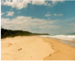
L10259 Lake Bunga