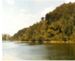
L10259 Lake Bunga