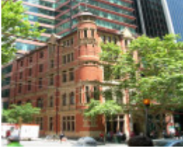
FORMER GOLLIN AND COMPANY BUILDING SOHE 2008