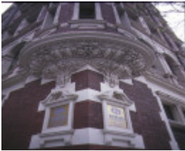
former gollin & company building bourke street melbourne front detail