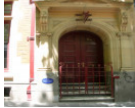
FORMER GOLLIN AND COMPANY BUILDING SOHE 2008