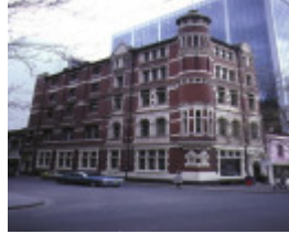
1 former gollin & company building bourke street melbourne frnt view