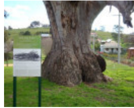
T11002 Eucalyptus camaldulensis