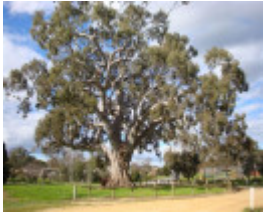
T11002 Eucalyptus camaldulensis