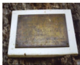
T11002 Eucalyptus camaldulensis