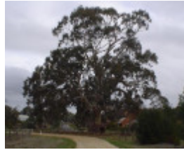
T11002 Eucalyptus camaldulensis