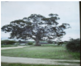
T11002 Eucalyptus camaldulensis