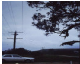
T11002 Eucalyptus camaldulensis