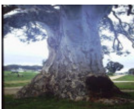
T11002 Eucalyptus camaldulensis