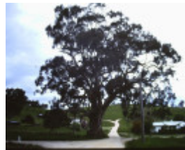
T11002 Eucalyptus camaldulensis