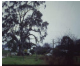
T11002 Eucalyptus camaldulensis