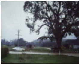
T11002 Eucalyptus camaldulensis