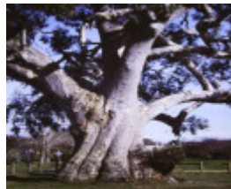
T11002 Eucalyptus camaldulensis