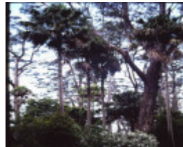
T11015 Livistona australis