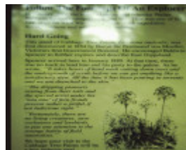
T11015 Livistona australis