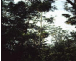
T11015 Livistona australis