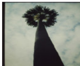
T11015 Livistona australis