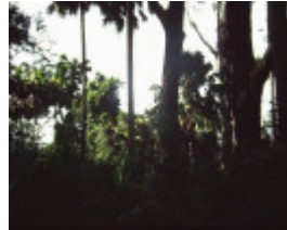
T11015 Livistona australis