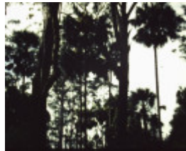
T11015 Livistona australis