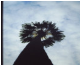
T11015 Livistona australis