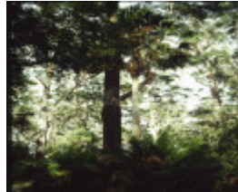
T11015 Livistona australis