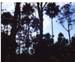
T11015 Livistona australis