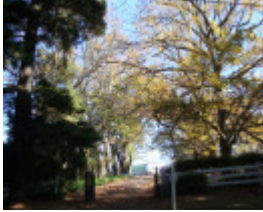
T11060 Quercus robur and Ulmus x hollandica