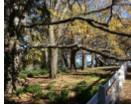
T11060 Quercus robur and Ulmus x hollandica