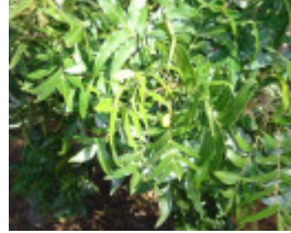
T11076 Harpephyllum caffrum