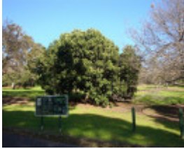
T11076 Harpephyllum caffrum