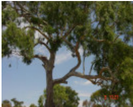
T11081 Eucalyptus camaldulensis