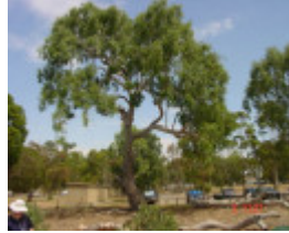
T11081 Eucalyptus camaldulensis