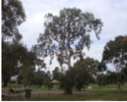
T11081 Eucalyptus camaldulensis