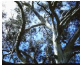
T11081 Eucalyptus camaldulensis