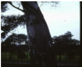
T11081 Eucalyptus camaldulensis