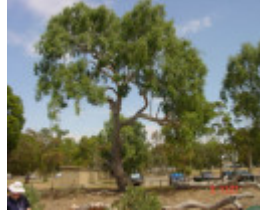
T11081 Eucalyptus camaldulensis