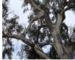
T11081 Eucalyptus camaldulensis