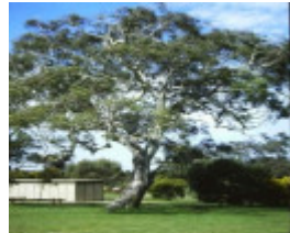
T11081 Eucalyptus camaldulensis