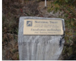
T11161 Eucalyptus melliodora