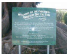
T11171 Ficus macrophylla sign