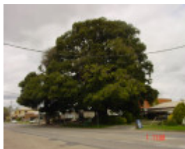
T11171 Ficus macrophylla