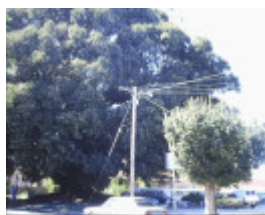
T11171 Ficus macrophylla