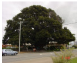
T11171 Ficus macrophylla