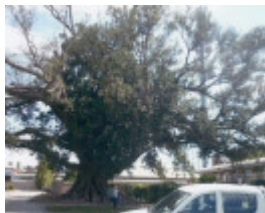
T11171 Moreton Bay Fig 22 Oct 2011