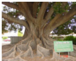
T11171 Ficus macrophylla