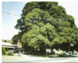
T11171 Ficus macrophylla