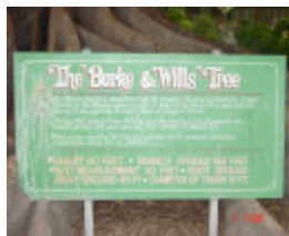
T11171 Ficus macrophylla