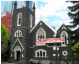
ST AUGUSTINES CATHOLIC CHURCH AND FORMER SCHOOL SOHE 2008