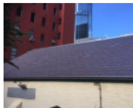
After Photographs - Reference F3925 2016