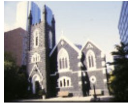
1 st augustines bourke street melbourne front view 1998