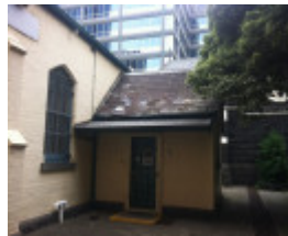
Before Photographs - Reference F3925 2014