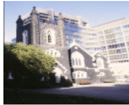
st augustines bourke street melbourne tower elevation 1998