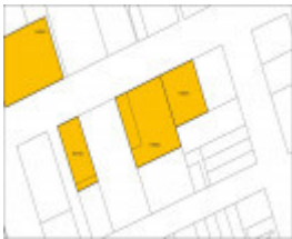
St Augustines Melbourne Registered Land Plan