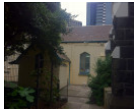
Before Photographs - Reference F3925 2014