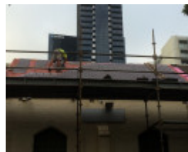
During Photographs - Reference F3925 2015