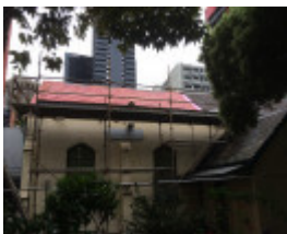
During Photographs - Reference F3925 2015